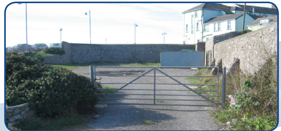
Image 3: View of the site looking west from the existing in foreground access off Eastern Promenade