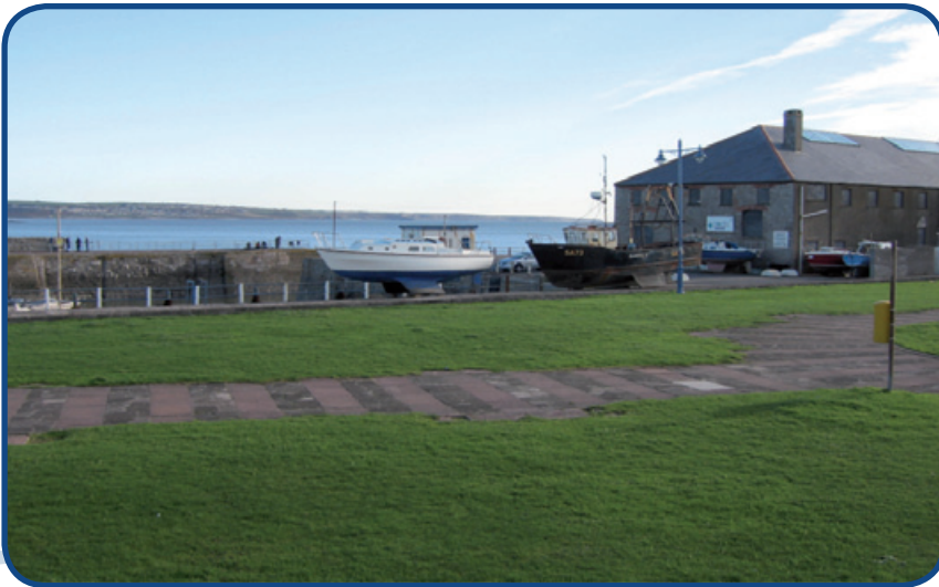
Image 12: View looking south east across the 'Cosy Corner' to the Jennings Building and harbour

To the north-west and north an unadopted lane leading from the Promenade to The Square and a 3 storey Victorian building (PH/ Hotel) bounds the site. To the west a small triangular grassed area (approx. 107m 2 ) adjoins the site. The south of the site is defined by the Promenade. Part of the northern boundary abuts the 2/3 storey Glamorgan Holiday Hotel. The Eastern Promenade defines the eastern edge of the land.