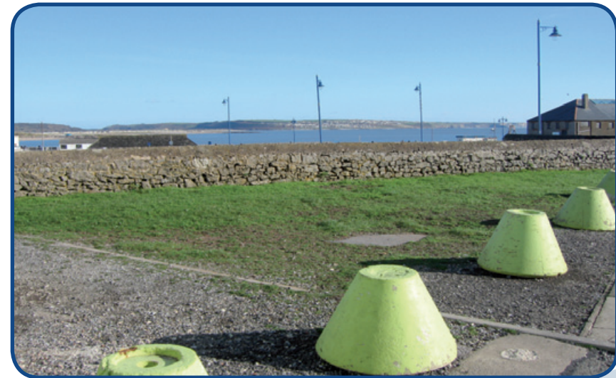
Image 11: View of the triangular grassed area and western boundary wall of the site – looking east

The site is contiguous with the town centre and a wide range of retail and leisure activities are immediately accessible. Other community uses such as schools, library and doctors surgery are all close to the site.