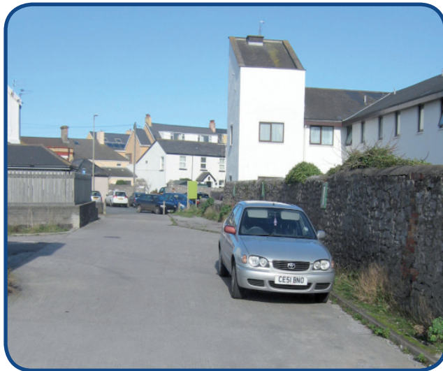
Image 10: View north from the site along the lane leading to The Square

The site is bounded to the south and east by adopted highways. The lane to the north and west is not an adopted highway. Footpaths edge the site to the east and south, providing easy pedestrian access to the facilities of the town.